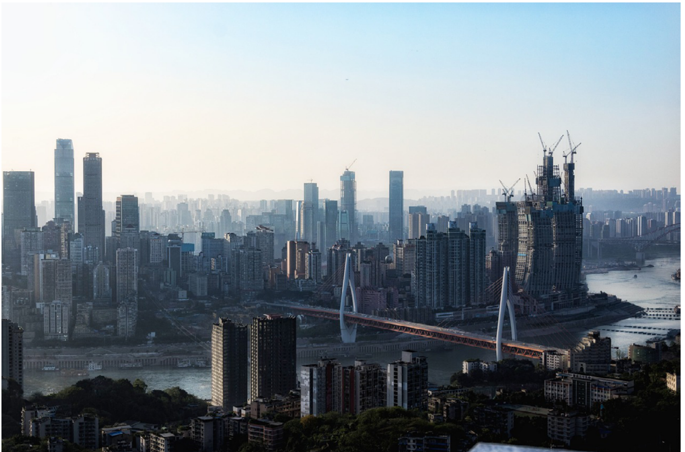
Chongqing in China

The EuroEyes Group will open the next clinic in Chongqing, as this great city is the commercial center in the southwest of China. In the new Royal Riverside Center, EuroEyes is now building its 7th eye clinic in China on 550m 2 of ground floor space. As Center of Excellence, EuroEyes offers the complete spectrum of refractive surgery at the highest level.